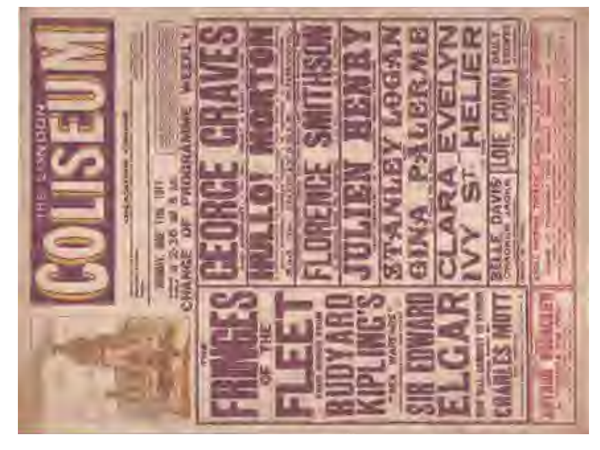
Fig. 4 Coliseum poster, reproduced by courtesy of the Beinecke Rare Book and Manuscript Library, Yale University.

As with most of the music he wrote during the war, Elgar threw himself into the project whole-heartedly (this goes some way to explaining his bitter comments later). On 4 June, a week before the first performance, he travelled to Harwich to borrow seamen's kit for the performances. On the first night (Monday 11 June) the four singers (as 'Charles Mott and Company': see the poster, fig. 4) performed outside a harbour-side pub against a backdrop which is more like Scotland than the East Coast of England where Kipling gathered his material. Perhaps realising that the performance needed lengthening, or the steely confidence of the last song 'The Sweepers' tempering, Elgar added an unaccompanied song, 'Inside the Bar', with words by the imperialist poet and novelist Sir Gilbert Parker, MP. 'Inside the Bar' was first performed on 25 June. Parker's poem contains a mild dose of realism, as sailors are reminded of the temptations facing their loved ones while they are away.