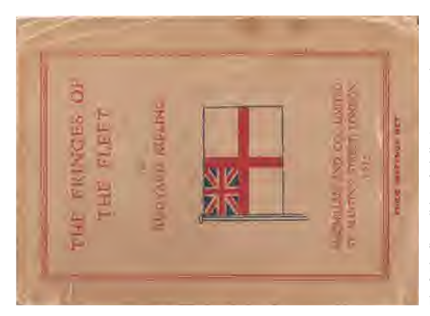
Fig. 3 The first edition of Kipling's poems. It is intended to place a colour version of this and fig. 4 or the Society's website.