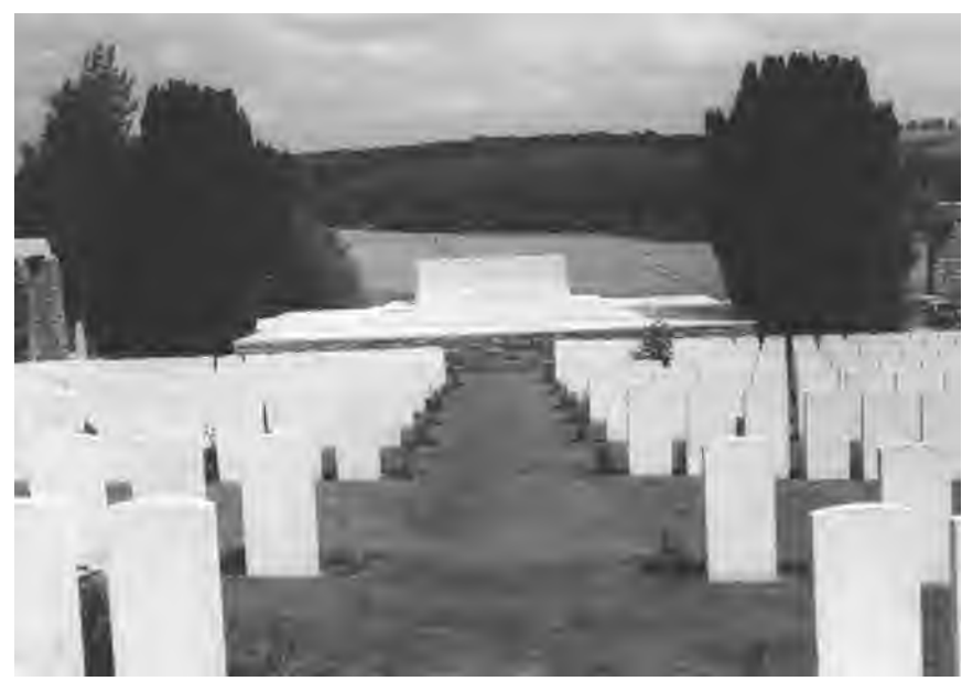
Bagneux Military Cemetery, Gezaincourt : Views of the cemetery toward (above) the Stone of Remebrance and (below) the Cross of Sacrifice Next page : The grave of Charles Mott