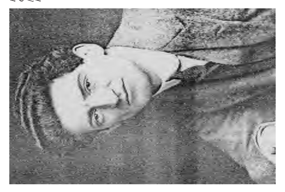
The Elgar Society Journal