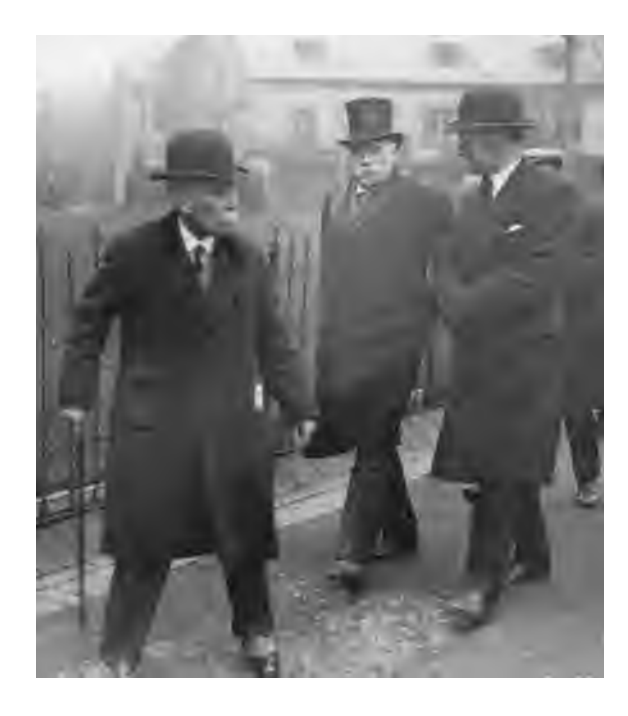
Volume 11 No 6 - November 2000