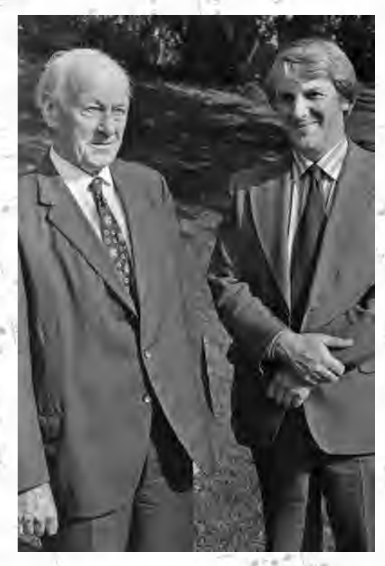
April 2014 Vol.18, No. 4