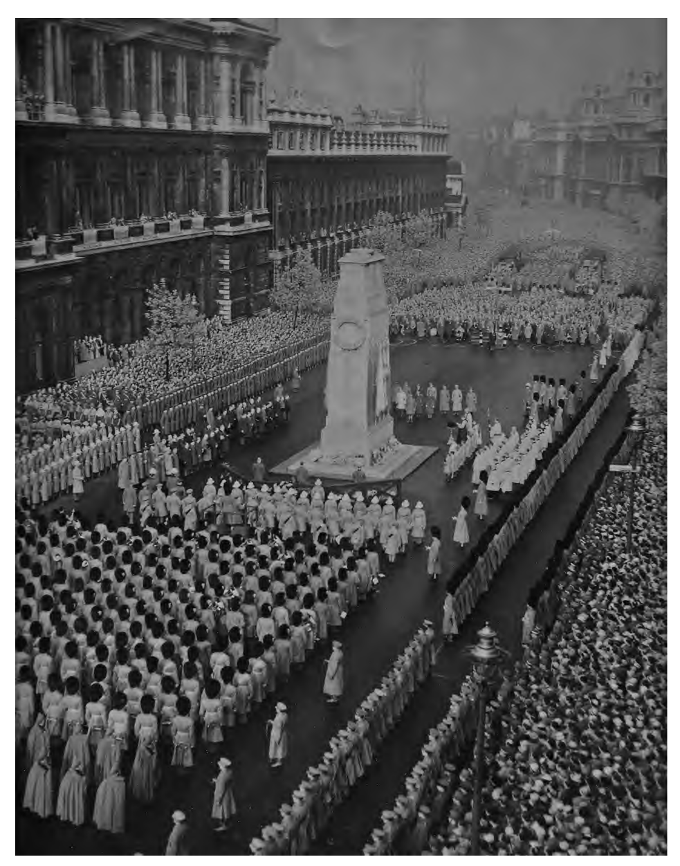
Fig.5: A National Service of Remembrance at the Cenotaph in the 1920s.