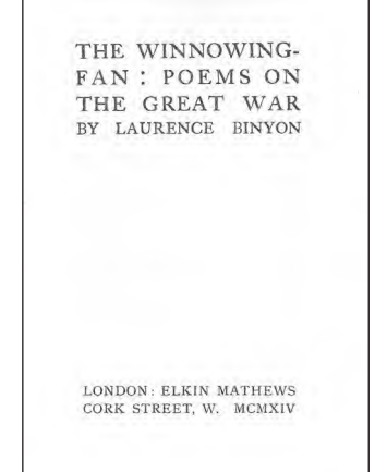
Fig.1: The title page of the first edition of The Winnowing Fan .

To many the relationship between a librettist and a composer is at best only of passing interest. This may be true in a number of instances but by citing a few examples, we can see that the librettist or author provides something critical in the development of the composer's art. Da Ponte, Boito, von Hofmannsthal and Piper are but obvious examples. In Elgar's case any such claim is unsustainable for the obvious reason he did not complete an opera and because, where he worked with